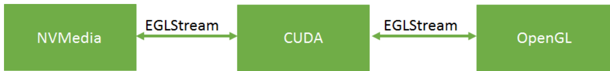
Figure 3. EGLStream Pipeline

NvMedia and CUDA connect as producer and consumer respectively to one EGLStream. CUDA and OpenGL connect as producer and consumer respectively to another EGLStream.