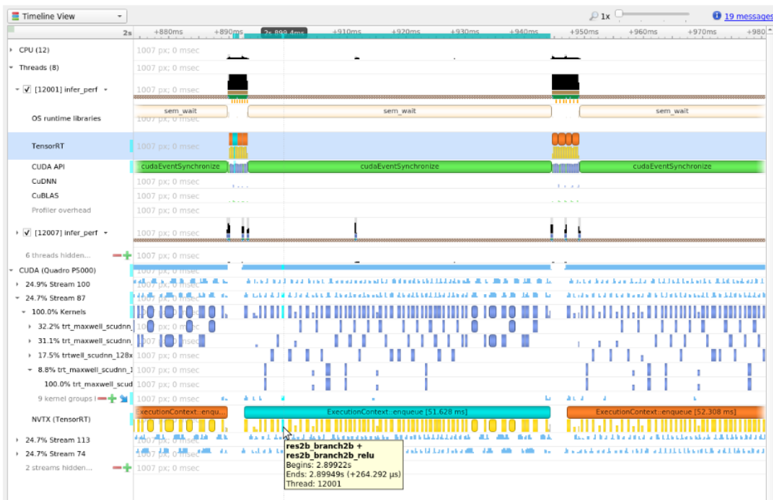
Figure 2 The kernels actually running on the GPU, in other words, it shows the correlation between the layer execution and kernel launch on the CPU side and their execution on the GPU side.

When profiling a TensorRT application, it is recommended to enable profiling only after the engine has been built. During the build phase, all possible tactics are tried and timed. Profiling this portion of the execution will not show any meaningful performance