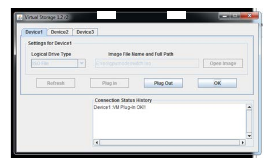
Figure 1 Connecting gpumodeswitch.iso via server remote management

The <code>gpumodeswitch.iso</code> file in the release package is intended for direct boot on a server platform, using the server's remote management capability. Connect the ISO file as an emulated storage device on the server, reboot the server, and use the BIOS boot menu to select the emulated device for boot.