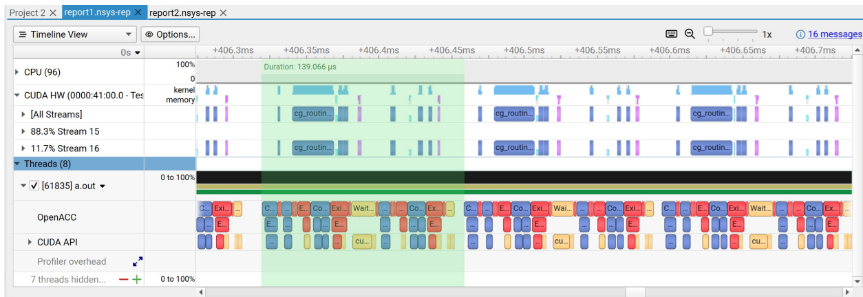
Figure 1: Nsight Systems Report1 Timeline

The Nsight Systems tool has very good support for profiling CUDA graphs. The timeline view will provide information on whether you have reduced the launch overhead gaps between the GPU kernels. Figure 1 shows a timeline of the iterations of the original OpenACC loop: