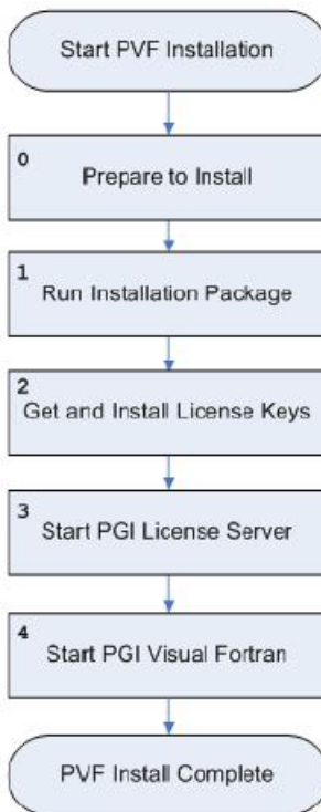
Figure 1 PVF Installation Overview

For more complete information on these steps and the specific actions to take for your operating system, refer to the remainder of this document.