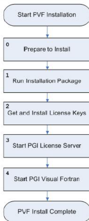
Figure 1 PVF Installation Overview

For more complete information on these steps and the specific actions to take for your operating system, refer to the remainder of this document.